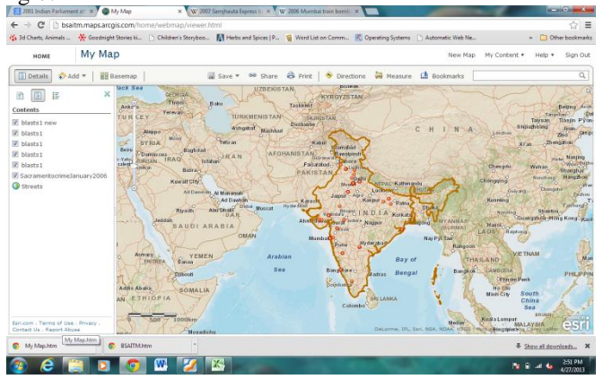
Fig-8: Blasts information extracted in table-1 on map

visualization of news events extracted in table 1 is shown in fig-7.